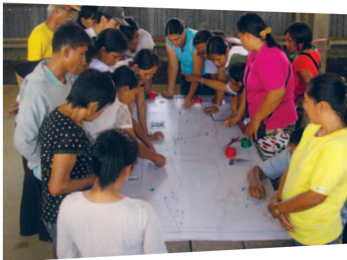
Coalition of Services of the Elderly